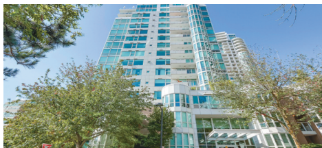
OCEAN TOWER AT 888 BEACH 1103 - 1501 Howe $1,438,000

This executive style fully furnished home is perched on a high floor with only 3 other suites. At almost 1200sf this 3 bed, 2 bath suite features hardwood floors, granite counter tops, 1 parking / 1 locker and a fabulous view with open balcony. Building has concierge and is steps to shopping, dining and the seawall.