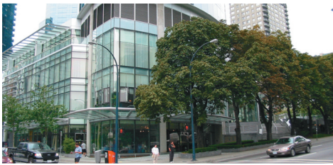
DOWNTOWN - ONE WALL CENTRE 4004 - 938 Nelson $2,450,000