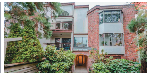
FAIRVIEW - STANFORD COURT 307 - 1775 W 10th $750,000

Custom built 5 bedroom, 4 bathroom home on 11 beautiful acres with a second house on the property. Features include hardwood floors, oversized windows for tons of natural light, gourmet kitchen, master-designed cabinetry, gas range, hot tub, easily wheelchair accessible, decks overlooking the river & the list goes on.