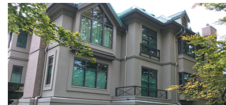
FAIRVIEW - CONNAUGHT GARDENS 103 - 628 W 12th $1,029,000

888 Beach - 1100 sq.ft. 2 bed, 2 bath NE corner unit in sought after 888 Beach. Great layout with good separation of bedrooms, large living/dining area/FP, hardwood floors, kitchen with granite counters, stainless appliances & 2 balconies. Great facilities include ID pool and gym. Bonus 2 parking and storage locker.