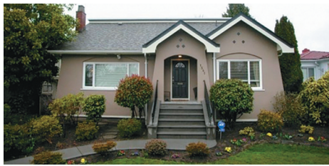
SOUTH GRANVILLE HOME 1541 W. 60th Avenue $3,198,000

One Wall Centre - One of Vancouver premier luxury skyscrapers, 1491 sf 1 bed, 2 bath unit offers gorgeous SW water views over English Bay and Vancouver skyline through 10'5" floor to ceiling windows featuring: H/W floors, Bosch S/S appliances, Sub-zero fridge, gas cooktop & granite counters. Available Now.