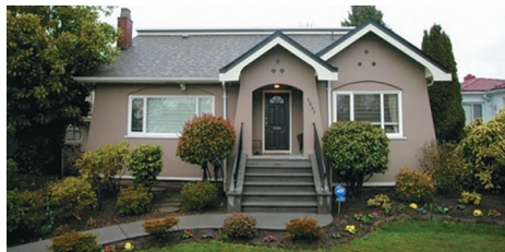
SOUTH GRANVILLE HOME 1541 W. 60th Avenue $3,299,000

Beautifully remodelled immaculately kept, 2000sf, 2 bed, 2 bath rancher on a double, 18,600sf lot right on the waterfront of Skaha Lake. Home features hardwood floors, rec-room with 12ft ceilings and wood burning FP, gas FP in Livingroom, crown mouldings, double garage and lots of storage.