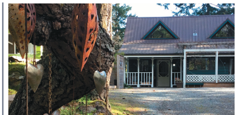
SALT SPRING ISLAND HOME 365 Scott Point Drive $849,000

Custom built 5 bedroom, 4 bathroom home on 11 beautiful acres with a second house on the property. Features include hardwood floors, oversized windows for tons of natural light, gourmet kitchen, master-designed cabinetry, gas range, hot tub, easily wheelchair accessible, decks overlooking the river & the list goes on.