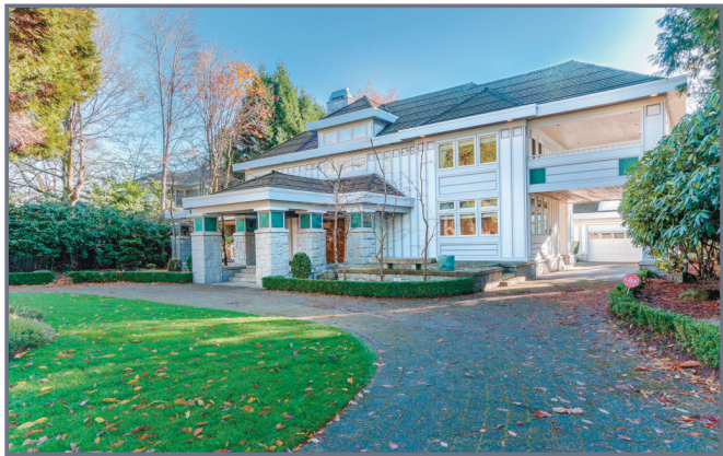
1138 MATTHEWS OFFERED AT $16,900,000

Rocklands Mansion - A stunning example of Vancouver history, this Heritage A designated 9000 sqft mansion sits on 3/4 of an acre of prime Shaughnessy parklike setting. This beautiful home has been completely restored with all of its heritage features intact and all the modern day comforts to be expected. From the sun-drenched kitchen featuring sub-zero and Miele appliances, upgraded wiring, plumbing & heating / Air Conditioning. 8 completely renovated bathrooms, original leaded glass windows, oak & mahogany woodwork plus remote window coverings throughout. This home is a 10 inside and out.