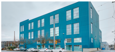
MOUNT PLEASANT, VE 530 Vernon Drive $1,150,000

This executive style fully furnished home is perched on a high floor with only 3 other suites. At almost 1200sf this 3 bed, 2 bath suite features hardwood floors, granite counter tops, 1 parking / 1 locker and a fabulous view with open balcony. Building has concierge and is steps to shopping, dining and the seawall.