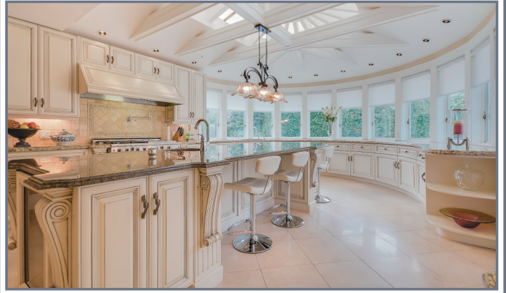
3589 GRANVILLE - 9000sf Shaughnessy house, 33,000sf lot