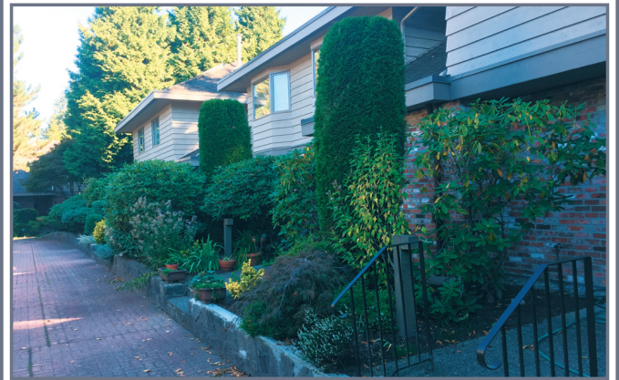
68 - 4900 CARTIER T/H OFFERED AT $2,638,000

First Shaughnessy home designed by Matsuzaki Wright sits on almost 22,000 sf of beautifully landscaped park like gardens with lush south facing back yard, one of the most coveted addresses in the city. 6,000 sf 5 bed, 5 bath home has updated gourmet chef's kitchen and beautiful oak hardwood floors. Steps to Osler Blvd and The Crescent.