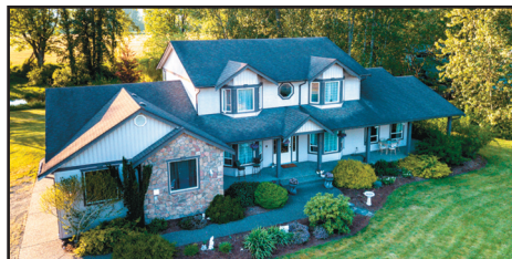
CHILLIWACK HOME 10285 Young Road $2,200,000

Custom built 5 bedroom, 4 bathroom home on 11 beautiful acres with a second house on the property. Features include hardwood floors, oversized windows for tons of natural light, gourmet kitchen, master-designed cabinetry, gas range, hot tub, easily wheelchair accessible, decks overlooking the river & the list goes on.