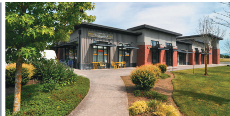
LARGE RETAIL BUILDING BELLINGHAM, WA 4260 Cordata Pkwy $3,995,000 USD

14,973 sqft retail building in Bellingham, WA. Located near large, popular retailers like Best Buy, T.J Maxx, Office Depot & more. Fast growing Cordata neighbourhood with lots of potential. Call or email for info package.