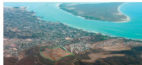
EL CERRITO - LA PAZ, MEXICO Development Site $4,000,000 USD

Dysco established in 1999 with large commercial and residential clientele base - selling goodwill, North American trademark and valuable lease opportunity. Located on a 12,000 sf downtown property, housing 30 mechanically sound trucks that are leased out at $6000/month ($200/truck) or outright purchase for an extra $400K (new over $2.5M).