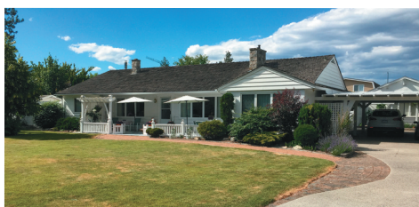
WATERFRONT PENTICTON HOME 167 Elm Avenue $2,100,000

我们将竭诚为您提供最优质的服务。请致电我们的经纪人：Jimmy Ng 778-788-0013