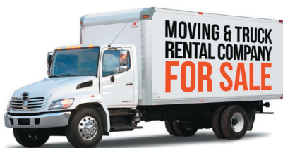
MOVING & TRUCK RENTAL COMPANY 295 Terminal Avenue $660,000

Part of a 9 lot land assembly totalling 62,799sf (over 40,000 passing vehicles/day) Under the OCP the City of Burnaby MAY allow a change in zoning to CD which allows high density residential.