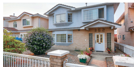
SOUTH VANCOUVER HOME 362 E. 56th Avenue $1,688,000

1.51 Acre lot with 4200 S/F 2 level home & a huge garage/storage. Property has farm status-raising sheep and chickens. Currently zoned SR-2, ppts on west side also available for possible land assembly.