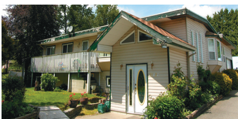
WILLOUGHBY LAND ASSEMBLY LANGLEY, BC - 1.5 ACRES 21427 83 Avenue $3,199,000

Beautifully remodelled immaculately kept, 2000sf, 2 bed, 2 bath rancher on a double, 18,600sf lot right on the waterfront of Skaha Lake. Home features hardwood floors, rec-room with 12ft ceilings and wood burning FP, gas FP in Livingroom, crown mouldings, double garage and lots of storage.