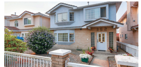
SOUTH VANCOUVER HOME 362 E. 56th Avenue $1,728,000

1.51 Acre lot with 4200 S/F 2 level home & a huge garage/storage. Property has farm status-raising sheep and chickens. Currently zoned SR-2, ppts on west side also available for possible land assembly.