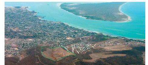
EL CERRITO - LA PAZ, MEXICO Development Site $4,000,000USD

Dysco established in 1999 with large commercial and residential clientele base - selling goodwill, North American trademark and valuable lease opportunity. Located on a 12,000 sf downtown property, housing 30 mechanically sound trucks that are leased out at $6000/month ($200/truck) or outright purchase for an extra $400K (new over $2.5M).