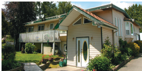
WILLOUGHBY LAND ASSEMBLY LANGLEY, BC - 1.5 ACRES 21427 83 Avenue $3,199,000

Beautifully remodelled immaculately kept, 2000sf, 2 bed, 2 bath rancher on a double, 18,600sf lot right on the waterfront of Skaha Lake. Home features hardwood floors, rec-room with 12ft ceilings and wood burning FP, gas FP in Livingroom, crown mouldings, double garage and lots of storage.