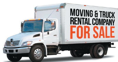
MOVING & TRUCK RENTAL COMPANY 295 Terminal Avenue $660,000

Part of a 9 lot land assembly totalling 62,799sf (over 40,000 passing vehicles/day) Under the OCP the City of Burnaby MAY allow a change in zoning to CD which allows high density residential.