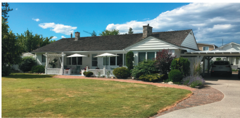
WATERFRONT PENTICTON HOME 167 Elm Avenue $2,100,000

我们将竭诚为您提供最优质的服务。请致电我们的经纪人：Jimmy Ng 778-788-0013