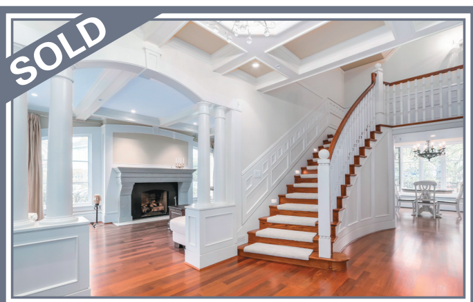
3812 OSLER OFFERED AT $7,880,000

First Shaughnessy home designed by Matsuzaki Wright sits on almost 22,000 sf of beautifully landscaped park like gardens with lush south facing back yard, one of the most coveted addresses in the city. 6,000 sf 5 bed, 5 bath home has updated gourmet chef's kitchen and beautiful oak hardwood floors. Steps to Osler Blvd and The Crescent.