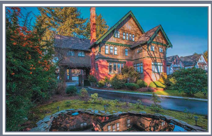
1469 MATTHEWS OFFERED AT $19,900,000

Rocklands Mansion – This heritage A designated 9000 sf 8 bedroom, 8 bathroom mansion sits on a ¾ of an acre of Prime Shaughnessy park like setting. This home has been completely restored with all of its heritage features intact and also offers all the modern day comforts to be expected.