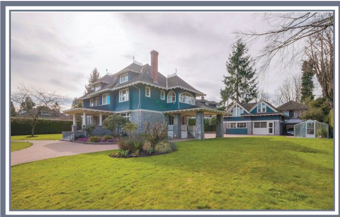
3589 GRANVILLE OFFERED AT $13,380,000

我们将竭诚为您提供最优质的服务。请致电我们的经纪人： Jimmy Ng 778-788-0013