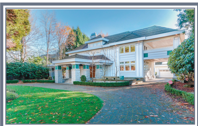
1138 MATTHEWS OFFERED AT $17,980,000

This First Shaughnessy 7,864 sf mansion sits on a 22,056 sf lot with new foundation, deepened basement and rain screened exterior. This stunning home features walnut hardwood floors, chef's kitchen/wok kitchen with high-end appliances, digital door lock, luxurious chandelier, custom drapery and a master suite that occupies an entire level.