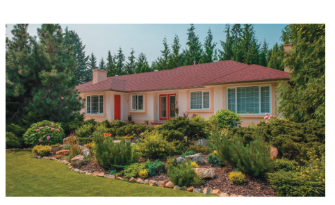
BLIND BAY - SHUSWAP, BC 2450 Blind Bay Rd. $749,000

Take advantage of this truly one of a kind prime development opportunity on Shuswap Lake with 500 feet of frontage on a 40,000 sf level lot and shared Lagoon. Act fast this will not last long!! www.2449blindbay.com