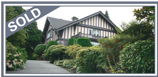
SHAUGHNESSY - VANCOUVER WEST 1080 Wolfe Avenue - $8,980,000

Structural and landscape Architects, interior designers, custom glass artists and design consultants crafted this ELEGANT and GRACEFUL corner lot home in 1st Shaughnessy. Completely re-built in 1993 and totally renovated in 2011 ($1M spent) - No expense spared in this almost 6,000 sq.ft. heritage style home on 10,430 s/f lot with 8 bedrooms and 6 baths on 4 levels. Gourmet kitchen including Bird's eye maple cabinets, gaggenau appliances, subzero fridge and lots of granite. Surround sound system with infared remotes in principle rooms, designer BI closet organizers & dressers, BI Vac, 7 zone hot water radiant heating together with air exchange (A/C) and water purification are only a few of the amenities offered.