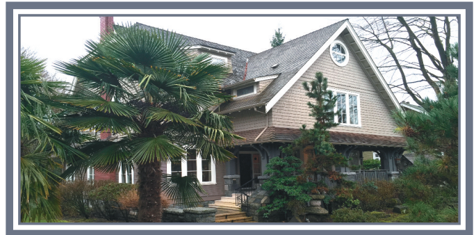
SHAUGHNESSY LUXURY 3812 Osler - Offered at $7,880,000

A stunning example of Vancouver history. This Heritage A designated 9,000 sq. ft. mansion sits on 3/4 of an acre (33,026 s/f) of prime Shaughnessy parklike setting. This beautiful home has been completely restored with all of it's heritage features intact and all the modern day comforts to be expected. From the sun-drenched kitchen featuring sub zero and Miele appliances, upgraded wiring, plumbing, heating & Air Conditioning, 8 completely renovated bathrooms to the original leaded glass windows, oak & mahogany woodwork - too numerous to list heritage features, this home is a 10 inside and out. Entire home has remote window coverings and triple paned windows. Serious inquiries by appointment only.