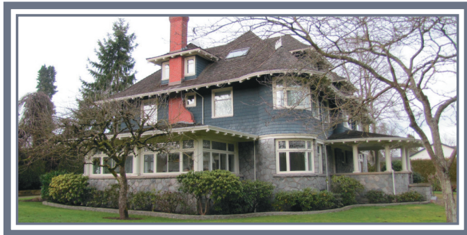
ROCKLANDS MANSION - SHAUGHNESSY 3589 Granville Street - Offered at $13,999,000

我们将竭诚为您提供最优质的服务。请致电我们的经纪人： Jimmy Ng 604-761-0011