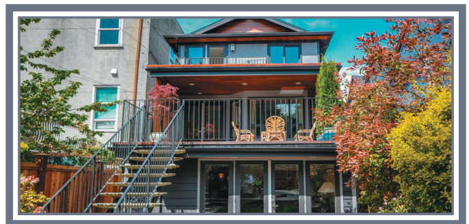
MOUNT PLEASANT - EAST VANCOUVER 790 E Georgia Street - $1,800,000

This stunning 6000 s/f 5 bedroom, 5 bathroom tudor Mansion sits on over 27,000 s/f of beautifully landscaped gardens. Large principal rooms on main floor with all heritage features intact. The quality and craftsmanship in this beautiful home cannot be matched today.