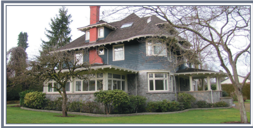
3589 Granville Street - SHAUGHNESSY MASTERPIECE

我们将竭诚为您提供最优质的服务。请致电我们的经纪人： Jimmy Ng 604-761-0011