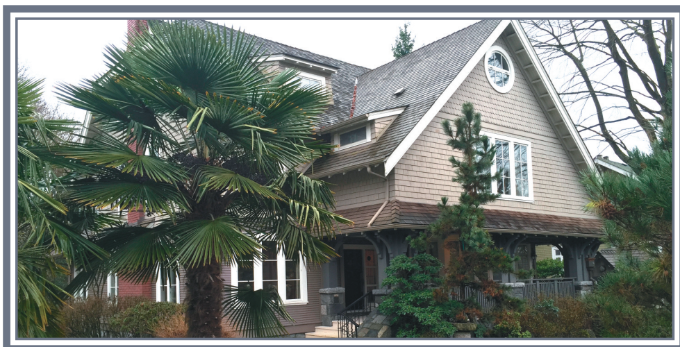
3812 Osler - SHAUGHNESSY LUXURY

4 lvl mansion w/8 bdrms, 8 baths, leaded glass windows, oak & mahogany paneled. Elegant, spacious, bright, air cond throughout, including custom wine cellar. High def theatre rm, rec rm, wet bar & exercise area. Loft has 2 bdrms + den, media or sitting rm. 684' self contained 1 bdrm suite.