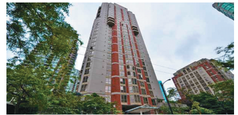
YALETOWN PENTHOUSE 3103-867 Hamilton $1,525,000

9.7 acres. Best priced Blueberry farm in Richmond. Duke and Bluecrop varieties. Includes approximately 3,000 sf 6 bedroom, 3 bathroom home with 2 car garage. Low taxes ($457/yr), close to Silver City Riverport Cinemas.