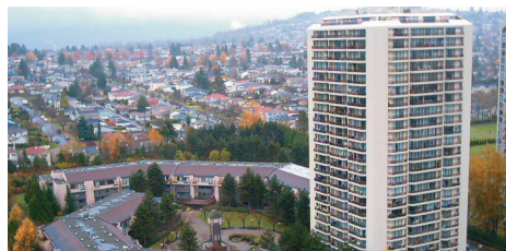
BRENTWOOD MALL - BURNABY 1101-4353 Halifax, Burnaby $1349,000

Woodwards - high floor, 650 S/F 1 bedroom with sweeping panoramic S/W views towards False Creek, open floor plan, hardwood floors, Juliette balcony...