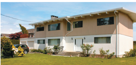
RICHMOND BLUEBERRY FARM 9660 No. 6 Road $3,488,000

9.7 acres. Best priced Blueberry farm in Richmond. Duke and Bluecrop varieties. Includes approximately 3,000 sf 6 bedroom, 3 bathroom home with 2 car garage. Low taxes ($457/yr), close to Silver City Riverport Cinemas.