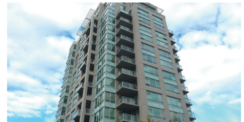
SYMPHONY - NORTH VANCOUVER PH PH1600-120 W 16th St., NV $1,998,000

N/W facing, 1350 S/F, 2 bed+den, 3 bath sub pent-house at Ateller designed by Robert Ledingham. Features stunning chef-inspired open kitchen with granite counters, SubZero appliances, 10' ceilings, A/C + huge S/W facing balcony. Vacant.