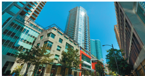
ATELLER - ROBSON & HOMER 3105-833 Homer $1,238,000

A California inspired 2100 s/f executive home with a quick walk to Downtown. Features incl. extensive use of decorative stone with luxurious wood cabinets. The appliance package: Sub-Zero, Bosh & Viking Kitchen brands. ($500K spent)