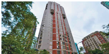
JARDINES LOOKOUT PH3 YEALETOWN 3103-867 Hamilton $1,590,000

Rarely available quiet East facing 1132 s/f, 2 bdrm, 2 bathroom, 2 level loft with large deck at T/V Towers, building #1. Great amenities + 24 hour concierge. Vacant.