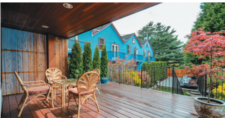
MOUNT PLEASANT, VE 790 E Georgia St. $1,799,000

A California inspired 2100 s/f executive home with a quick walk to Downtown. Features incl. extensive use of decorative stone with luxurious wood cabinets. The appliance package: Sub-Zero, Bosh & Viking Kitchen brands. ($500K spent)