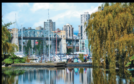
LAGOONS (GRANVILLE ISLAND) 1511 Mariner Walk $688,800

A California inspired 3 Level 3,050 sf. 4 Bed, 3 Bath home. Extensive use of travertine, marble, slate, granite, mahogany, oak & cherry wood. Fifteen minute walk to Vancouver city centre. A truly complete property.