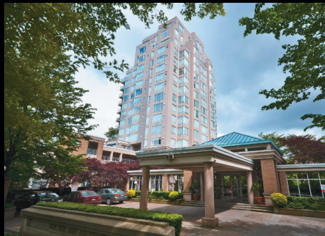
CAMBRIDGE GARDENS 202 – 2668 Ash $519,000

Executive 800 sf 2 Bed, 2 Bath NE corner unit has wrap around views of Mountains, Burrard Inlet and City. Fabulous open floorplan with no wasted space and open balcony. In the heart of downtown - steps to everything Vancouver has to offer - shopping, transit, restaurants, theatres and entertainment.