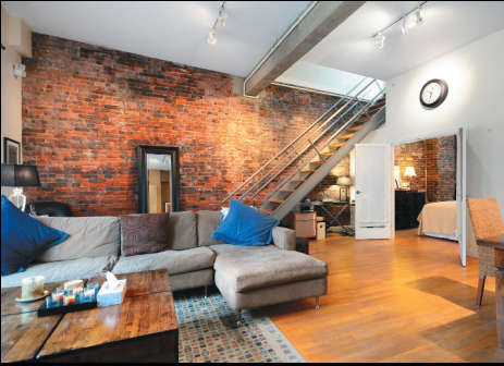
DEL PRADO (YALETOWN) PH 603 – 1155 Mainland $1,398,888

1,319 sf Penthouse Loft with HUGE 1,300 sf fully serviced Rooftop Deck. Exceptional 2 Bdrm, 2 Bath AC unit. Impressive Brick Feature Walls, 1" HW Floors, Gas Fireplace & 11' Ceilings. Rare find in Yaletown! 2 Secured Ground Level Parking Spots in building.