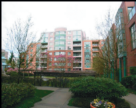
PACIFICA NORTHGATE 306 – 518 W 14th $499,000

Open plan, 904 sf, 1 Bedroom, North exposure, balcony, 1 bathroom, one parking spot. Could be converted to two bedrooms. This suite is located in a quiet area with excellent connections to transit. Facilities include: Indoor Pool, Sauna, Fitness Area, Rentable Suite and Party Room.