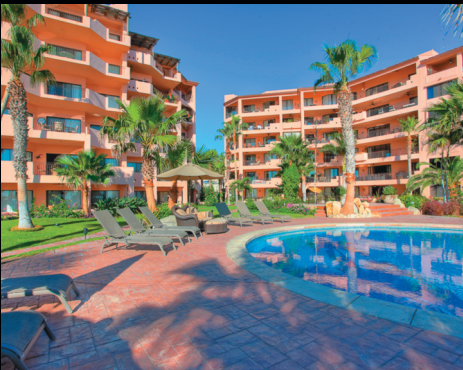
SAN JOSE DEL CABO, MEXICO Villa 4 El Zalate, Cabo San Lucas

101 – 2110 s/f 2 Bd, 2 Bth $525,000 302 – 1406 s/f 2 Bd, 2 Bth $525,000 403 – 1396 s/f 2 Bd, 2 Bth $499,000