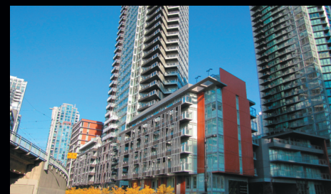
THE MARK ASSIGNMENTS 1372 Seymour

895 sf, south facing, 2 bed + den/baby room & large balcony. Strata fees incl. gas, heat & hot water. Walk to Skytrain access & T&T Supermarket & Costco, BC Place, Tinseltown, Movie Theater, False Creek & Downtown. 1 Parking Stall.