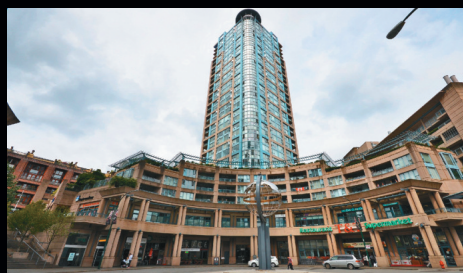
PARIS PLACE (TINSILTOWN) 402 – 183 Keefer Pl. $429,900

Stunning Ocean & False Creek VIEWS from this Spacious 704 sf, 1 Bedroom Suite perched high on the SW corner. This home boasts an open layout, warm engineered maple floors throughout, comes with Parking and Storage!