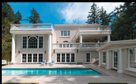
GLENEAGLES, WEST VAN 6089 Gleneagles Dr. $8,988,000

This magnificent estate is a showcase of the finest craft & finishes. 6 Bed, 8 Baths 9,500+ sf of Georgian inspired architecture. Features: Elevator, Infrared Sauna, Gym, Surround Sound, AC, Pool & Pool House.