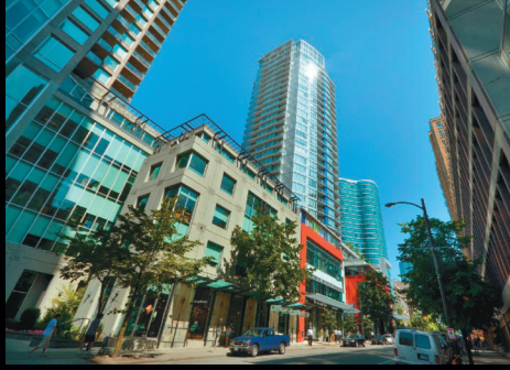
ATELIER (HOMER + ROBSON) 3105 – 833 Homer $1,265,000

1,319 sf Penthouse Loft with HUGE 1,300 sf fully serviced Rooftop Deck. Exceptional 2 Bdrm, 2 Bath AC unit. Impressive Brick Feature Walls, 1" HW Floors, Gas Fireplace & 11' Ceilings. Rare find in Yaletown! 2 Secured Ground Level Parking Spots in building.