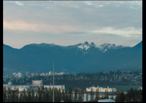
ZOEY (HASTINGS + CASSIAR) PH310 – 3423 E Hastings $739,000

1,350 sf, NW Corner, 2 Bedroom + Den + Storage Sub Penthouse with 3 Bathrooms & Terrace. Fabulous City Views, open spacious living area, stunning chef-inspired kitchen with granite countertops, top of the line appliances, AC. Tenanted at $3,400/month.