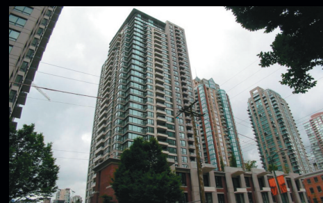
YALETOWN PARK I 2706 – 928 Homer $499,000

Waterfront home sitting on the waters edge. 1 level t/h style with private entrance. Corner unit. 2 beds, 2 patios, lots of updates w/ gourmet kitchen w/ a window & high end appliances. Steps to the Seawall and Granville Island.