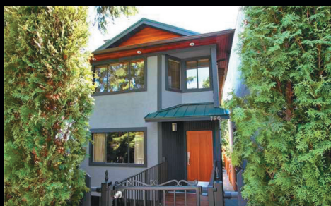
MOUNT PLEASANT, VANCOUVER 790 E Georgia $1,490,000

One of a kind Westside European style home in quiet part of Southland neighborhood. South facing 8712 s/f of finished area. Bonus, extra large 4 car garage & a crawl space for storage. Minutes from Richmond, Downtown and Airport.