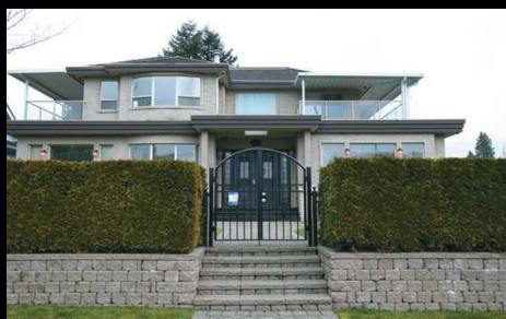
KERRISDALE, VANCOUVER 6996 Laburnum 3,998,000

This magnificent estate is a showcase of the finest craft & finishes. 6 Bed, 8 Baths 9,500+ sf of Georgian inspired architecture. Features: Elevator, Infrared Sauna, Gym, Surround Sound, AC, Pool & Pool House.