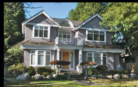
SOUTHLANDS, VANCOUVER 3639 W 50th $2,298,000

Come see this Fabulous MANSION. Excellent Craftsmanship & Finishing with attention to details. 5,382 sf, 7 Bed/7 Bath. Huge 75x130 lot (9,685 sf) Large Open kitchen, Radiant floors, AC, HRV, GYM, THEATRE, INDOOR POOL, SAUNA, STEAM ROOM.