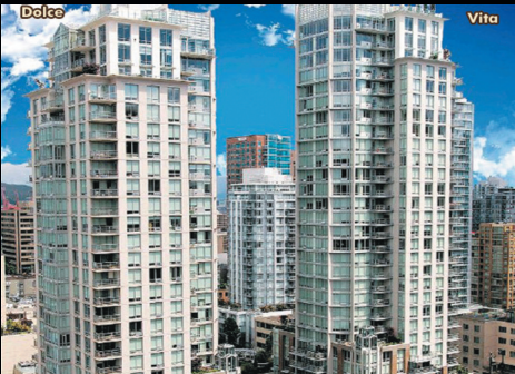
DOLCE (YALETOWN) 2702 – 535 Smithe $749,900

NW Corner. 1,762 sf, 4 Bed, 4 Bath Penthouse Brazilian HW Flooring, Granite Countertops, Stainless Appliances, Wine Fridge, Gas Stove, Gas FP & AC. 6 Parking Stalls & 2 Storage UNOBSTRUCTED PANORAMIC VIEWS.