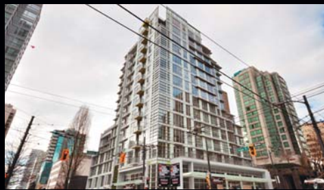
LIVE/WORK IN ALTO - $749,000 TH1211 - 1205 Howe, Vancouver

Bright South facing 527 s/f 1 bed + flex unit with hardwood floors that is currently rented at $1195/mo. Across street from Coal Harbour Park & Community Centre & minutes from Stanley Park. Gym, indoor pool, board rooms, billiard room, party room & guest suites. Pets & rentals OK. 1 parking stall and 1 storage locker.