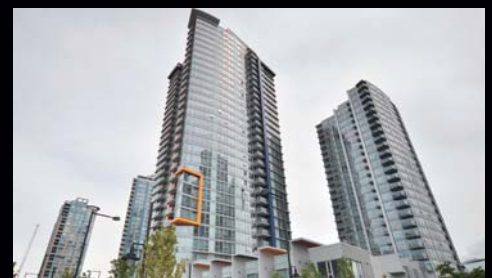
SPECTRUM 4 TWO 1 BEDROOMS

17+acres, drilled well on a knoll. Sweeping views of valley, mountains & river. Golf Course nearby. May be sub dividable into 3 parcels. Most desirable area in the country & 10 mins to Seton Lake. Build your dream home - Seller says Sell!