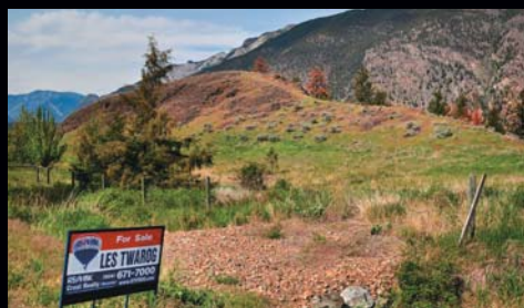
17 ACRES IN LILLOOET - 175,000 8810 Texas Creek Rd. (8km S of Lillooet)

Over 1100 sq.ft 2 bed, 2 bath corner townhome. Quiet courtyard corner unit with lots of light, private yard and open balcony. Fully rainscreened building 5 years ago, in a fabulous central location. 1 parking and storage. Quiet courtyard corner unit with lots of light, private yard and open balcony.