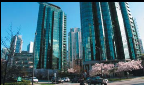
1 BRM - SOUTH FACING - $349,000 508 - 588 Broughton, Vancouver

Stylish concrete 2 bdrm 1483 sf 2 level garden residence at "Concords Quatwest Resort" overlooking garden and pond. 13' ceilings in the master bdrm, gourmet kitchen w/granite countertops. Work downstairs (613 sf), live upstairs (870 sf). Fantastic opportunity for this dual zone property.