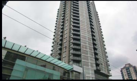
THE BRAVA - $314,000 1707 - 1155 Seymour, Vancouver

-Prime Coal Harbor location - Fabulous 1000 sqft 2 bed, 2 bath-insuite storage/computer room in excellent like new condition in one of the most sought after and exclusive neighborhoods in Vancouver. Wonderful layout with open plan living/dining/kitchen, open balcony, fireplace, insuite laundry.