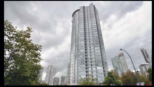
LIVE/WORK OFFICE STRATA 1050 Pacific (2J 1033 Marinaside), Van

Located in the heart of Vancouver's most prestigious community, this modern Yaletown studio exceeds every expectation. 418 sf remodelled studio with new carpets and outdoor balcony facing North. Features in suite laundry & a gas fireplace. No parking and no locker. Will go fast.