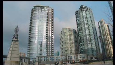
753 SF 1 BED+DEN - $599,000 3006 - 1495 Richards, Vancouver

Fabulous, brand new 1053 sf live/work, 1 bedroom, 2 bath centrally located townhouse close to everything. 10' ceilings, designer finishes, Electrolux SS and wood panelled apps, polished comp. Stone counter tops, central location. Unit has a street entrance with a small patio in front. 1 parking and 1 storage locker.