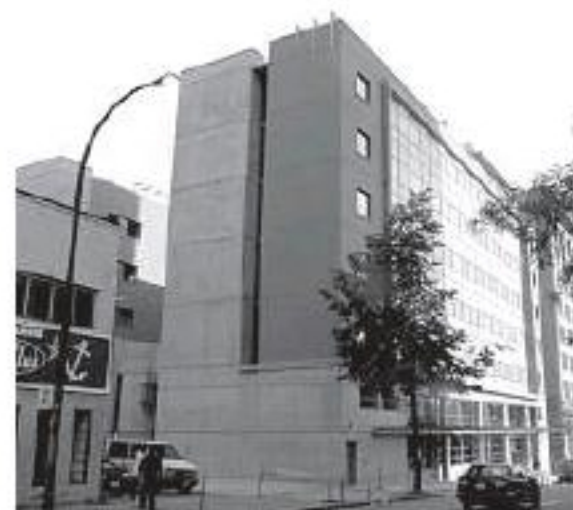
Belkin House – South Vancouver

"My physical health is better, my mental health is better since I moved into Candela Place. I really want to continue with my positive lifestyle, to get Christmas gifts for my grandchildren and to get to know my family better."