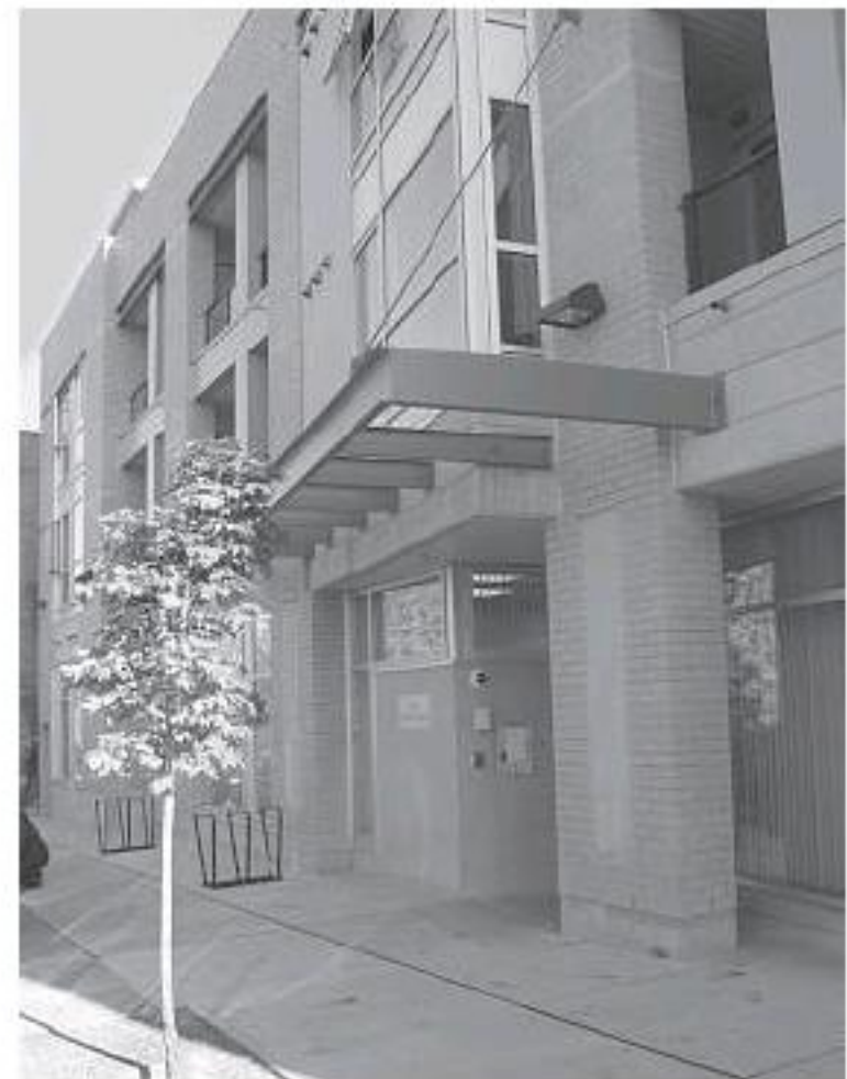
Fraser Street – Vancouver