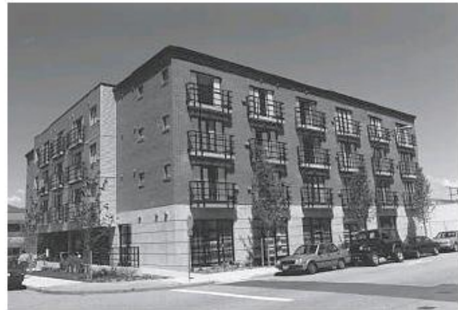
The Yukon Housing Centre