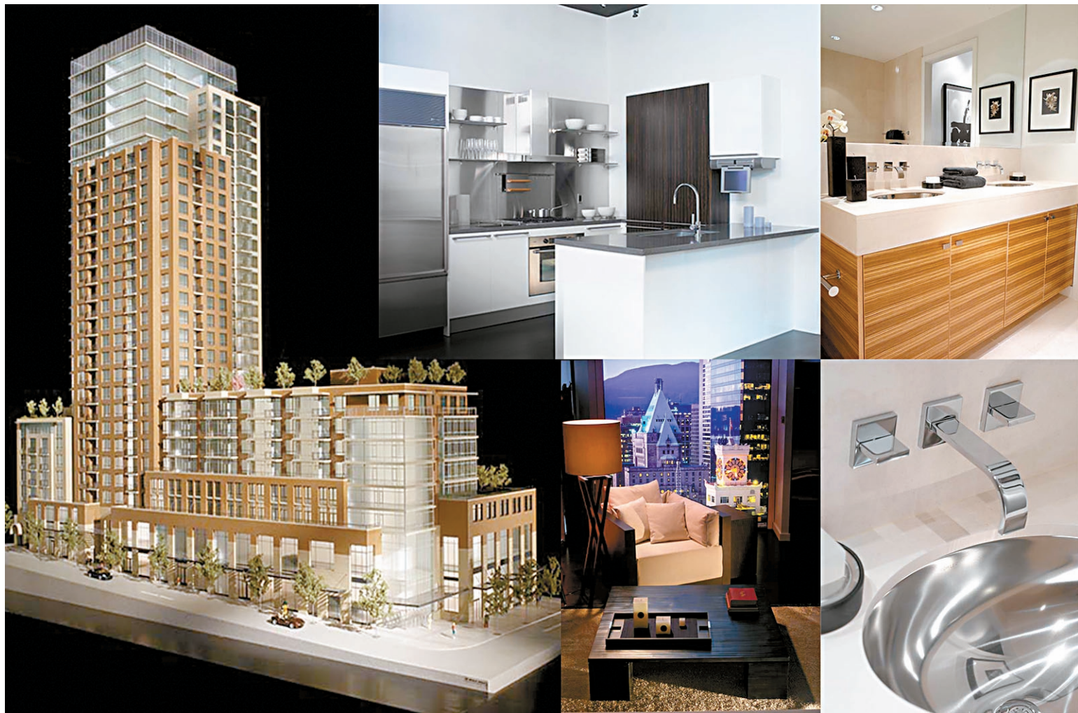
L'Hermitage en Ville features sophisticated tower and pavilion residences on Robson Street from Vancouver's leading architects and designers. The inspiring showroom is open Saturday to Thursday from 12 noon to 6 p.m., at 688 Richards Street, at Georgia. For complete information, phone 604-605-1118, or visit the website at www.lhvancouver.com.