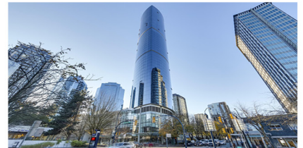
ONE WALL – SW OCEAN VIEW 4004 – 938 NELSON $2,450,000

Located in West End – this corner suite facing south west is in move in condition. Price includes all furniture, plates & cutlery. Perfect for students or investors!