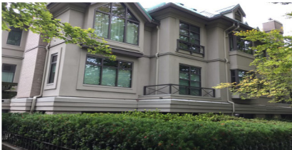
FAIRVIEW – VGH 101 - 628 W 12TH FAIRVIEW $995,000

The Palladio - Completely renovated North/West corner unit with the stunning views of Coal Harbour and Stanley Park from every room. Over 1250 sq.ft. with floor to ceiling windows to capture the light, this 2 bed, 2 bath + office has gone through a complete renovation with no expense spared.