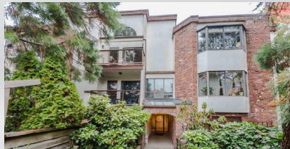
STANFORD COURT – KITSILANO 307 – 1775 W 10 TH $699,000

SPECTRUM 2 by Concord Pacific, N/E corner 2 bed+Den, 2 bath home w/great city views. Features include; O/D balcony, floor to ceiling windows, open Kitchen, I/S storage & an Office/Den. Enjoy Club Ozone Rec Fac incl; 80 ft I/D pool, hot tub, steam/sauna rooms, fully equipped gym, 1 parking stall incl.