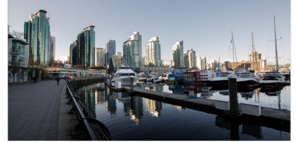
THE PALLADIO – COAL HARBOUR 2302 – 1228 W HASTINGS $2,280,000

The Seastar - This sundrenched S/W Corner home has English Bay views from every room. Almost 1000 sq.ft with 2 bed, 2 bath and solarium with numerous updates including quartz countertop, new Bosch and Fischer Paykel appliances and maple hardwood floors.