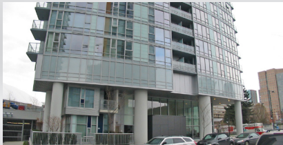
SPECTRUM TOWER 2 – ABOVE COSTCO 1608 – 668 CITADEL $899,000

SPECTRUM 2 by Concord Pacific, N/E corner 2 bed+Den, 2 bath home w/great city views. Features include; O/D balcony, floor to ceiling windows, open Kitchen, I/S storage & an Office/Den. Enjoy Club Ozone Rec Fac incl; 80 ft I/D pool, hot tub, steam/sauna rooms, fully equipped gym, 1 parking stall incl.