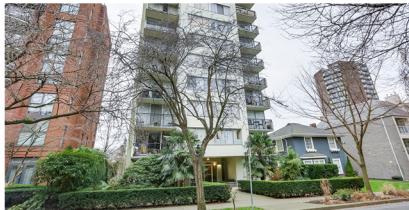
THE ST. PIERRE – WEST END 301 – 1534 HARWOOD $349,888

Spacious north facing ground floor unit at "Connaught Gardens", 1218 s/f 2 bed, 2 bath with huge 300 s/f private fenced patio & 2 UG parking stalls. Features incl; Gas FP, wood blinds, new stainless appliances incl Washer/Dryer and new HW tank.