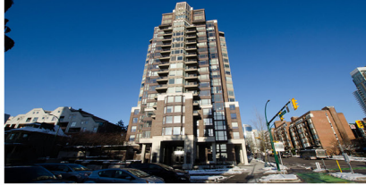
THE SEASTAR – WEST END 1005 – 1003 PACIFIC $959,000

This First Shaughnessy Home with 5 bedrooms and 5 bathrooms sits on almost 22,000 s/f of beautifully landscaped gardens with lush south facing yard. Recently updated gourmet chef's kitchen with island, large rooms with oak HW floors. Home is post 1940s with a buildable lot, if desired.