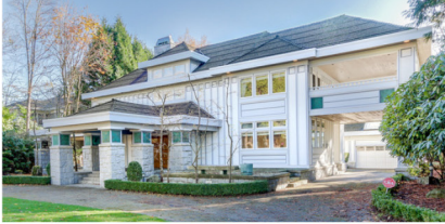
SHAUGHNESSY MANSION - 9000 S/F 1138 MATTHEWS $16,980,000

我们将竭诚为您提供最优质的服务。请致电我们的经纪人：Jimmy Ng 604-761-0011