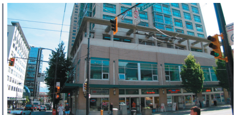
DOWNTOWN VANCOUVER OFFICE 208 - 515 W Pender $209,900

237 sf north facing office strata for sale, includes all furniture, no parking stall and no storage, Pay Parking is available by the hour or monthly. Suite features new Heat Pump (A/C) in 2011 ($5K), laminate floors and an unique over height ceiling section for extra storage or can be used as a loft.