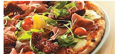
UNFORGETTABLE PIZZA BIZ 450 W. 8th Avenue $79,000

Part of a 9 lot land assembly totalling 62,799sf (over 40,000 passing vehicles/day) Under the OCP the City of Burnaby MAY allow a change in zoning to CD which allows high density residential.