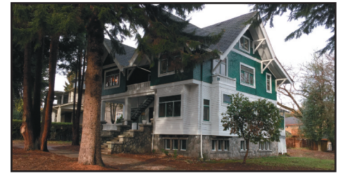
FIRST SHAUGHNESSY 1033 Balfour Avenue $5,990,000

895 Gibsons Way, Cedars in Hotel and Convention Centre on a 62,000 sf lot. 909 Gibsons Way, Gibsons Cinema sits on a 30,000 sf lot. Great development opportunity, only a 7 minute drive from the Langdale ferry terminal on the Sunshine Coast.