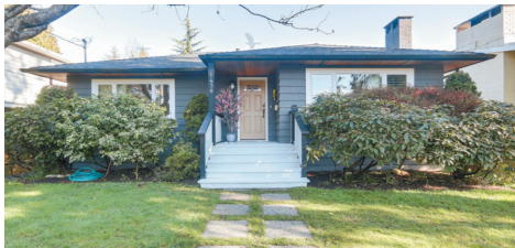
NORTH VANCOUVER HOME 1438 Laing $1,799,000

5000sf home with 4 legal suits (Multiple Dwelling Licence No 16-127997) on a large 15,339 sf lot. Excellent opportunity remodel to your taste and design, change to 4 strata titles or qualify for a small infill.