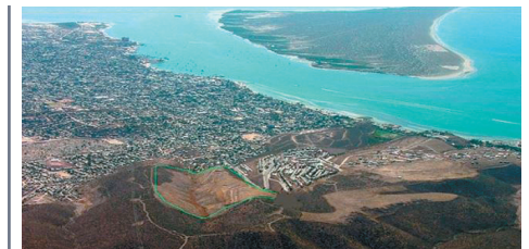
EL CERRITO - LA PAZ, MEXICO Development Site $4,000,000USD

1.51 Acre lot with 4200 S/F 2 level home & a huge garage/storage. Property has farm status-raising sheep and chickens. Currently zoned SR-2, ppts on west side also available for possible land assembly.