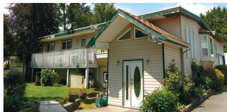
WILLOUGHBY LAND ASSEMBLY LANGLEY, BC - 1.5 ACRES 21427 83 Avenue $3,199,000

1.51 Acre lot with 4200 S/F 2 level home & a huge garage/storage. Property has farm status-raising sheep and chickens. Currently zoned SR-2, ppts on west side also available for possible land assembly.