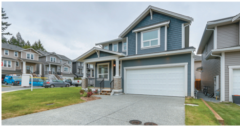
MAPLE RIDGE NEW HOME 11276 243A Street $995,000