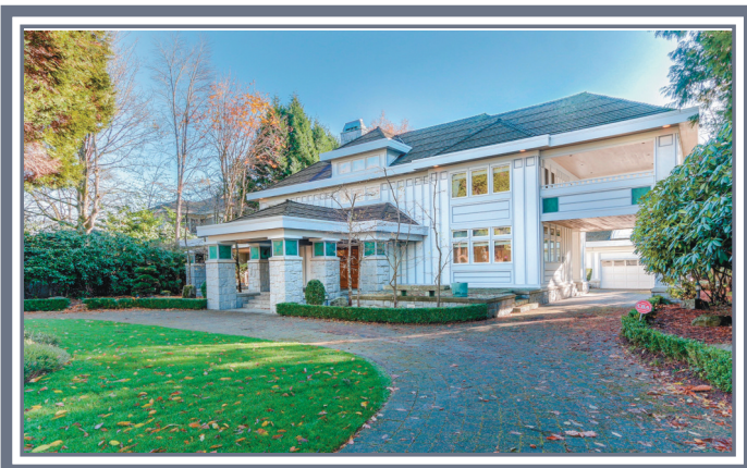
1138 MATTHEWS OFFERED AT $17,980,000

Exclusive Listing! 1318 Minto (32nd & Granville) Modern 12,000 sf Shaughnessy Mansion on a 26,000 sf lot (149X178) built in 2010. This solid concrete 3 level home features over size windows, 6 bedrooms, 7 baths , 5 fireplaces, wine cellar outdoor pool, Cabana, basketball court, games room and a golf simulator. There was no expense spared. The open kitchen plan offers a great entertainment area featuring granite counters, hardwood floors with radiant heat and a Wok kitchen.