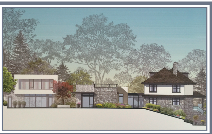
1233 TECUMSEH OFFERED AT $19,900,000

First Shaughnessy home designed by Matsuzaki Wright sits on almost 22,000 sf of beautifully landscaped park like gardens with lush south facing back yard, one of the most coveted addresses in the city. 6,000 sf 5 bed, 5 bath home has updated gourmet chef's kitchen and beautiful oak hardwood floors. Steps to Osler Blvd and The Crescent.