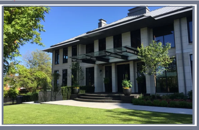
1318 Minto Offered at $35,800,000

Rocklands Mansion – This heritage A designated 9000 sf 8 bedroom, 8 bathroom mansion sits on a ¾ of an a acre of Prime Shaughnessy park like setting. This home has been completely restored with all of its heritage features intact and also offers all the modern day comforts to be expected.