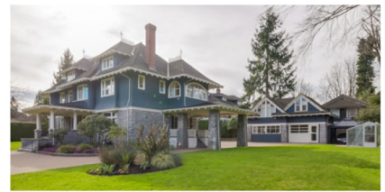
SHAUGHNESSY MANSION 3589 GRANVILLE $13,380,000

2 bed, 2 bath 1070 sf SE corner unit features recently refinished oak floors, contemporary light fixtures and air conditioning. Amenities includes a world class gym, an indoor pool, a bar and restaurant, room service & housekeeping.