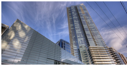
SHANGRI-LA LIVING 3104 – 1111 ALBERNI $884,000

Heritage A designated 9000 sf mansion hits on ¾ of an acre with 8 bedrooms and 8 bathrooms. This beautiful home has been completely restored with all of its heritage features intact and all of the modern day comforts to be expected.