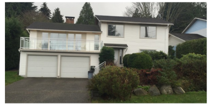
DELTA, BC 5118 STEVENS DRIVE $1,329,000

Luxurious 1,322 s/f 3 bedroom SW facing Penthouse with spa like baths and sleek contemporary Italian kitchen. Features engineered hardwood, air conditioning, forced air heat and 9' ceilings, 144 s/f balcony & 107 s/f roof terrace, 2 SxS parking and 1 storage locker. Completion Spring 2017.