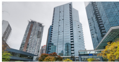
WALL CENTRE 1410 – 1050 BURRARD $996,000

This First Shaughnessy Home with 5 bedrooms and 5 bathrooms sits on almost 22,000 s/f of beautifully landscaped gardens with lush south facing yard. Recently updated gourmet chef's kitchen with island, large rooms with oak hardwood floors. Home is post 1940s with a buildable lot, if desired.