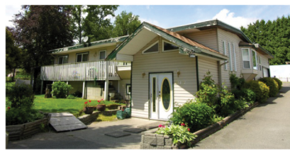
WILLOUGHBY LAND ASSEMBLY 21427 83 AVE $3,199,000

"Paradise Trials" a unique equestrian community located in the Chekamus Valley, Squamish BC consisting of 82 serviced lots and a proposed 10 Acre horse riding centre. More info at www.6717000.com/squamish