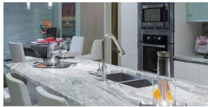
WEST 10TH & MAPLE (ASSIGNMENT) 809 - 2033 10TH AVE $1,988,000

This rarely available North facing, 1 bedroom high floor '04 unit features luxurious interior design elements including a Gourmet kitchen, Bosch and Miele appliances, Sub-Zero Fridge, granite counters, GEOTHERMAL heating & A/C, 9 ft ceilings and engineered hardwood flooring throughout and one parking stall