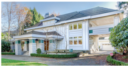
SHAUGHNESSY MANSION 1138 MATTHEWS $17,980,000

我们将竭诚为您提供最优质的服务。请致电我们的经纪人: Jimmy Ng 604-761-0011