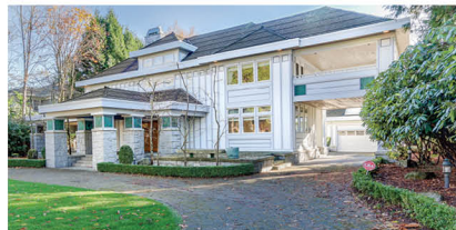
SHAUGHNESSY MANSION 1138 MATTHEWS $18,880,000

"Paradise Trials" a unique equestrian community located in the Chekamus Valley, Squamish BC consisting of 82 serviced lots and a proposed 10 Acre horse riding centre. More info at www.6717000.com/squamish