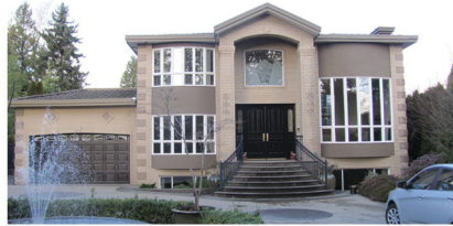
NORTH BURNABY HOME 8165 GOVERNMENT RD $3,500,000

6000 sq/ft heritage style home with 8 bedrooms and 4 bathrooms on 4 levels. Gourmet chef's kitchen appointed with high end appliances and finishes. Large principal rooms for entertaining, media room with wine cellar. 10,000 sq/ft lot.