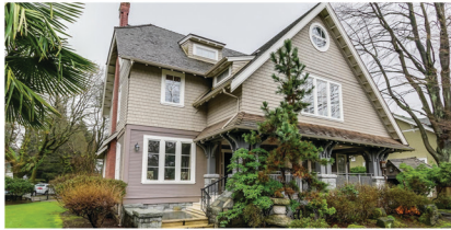
SHAUGHNESSY LUXURY HOME 3812 OSLER $7,880,000

我们将竭诚为您提供最优质的服务。请致电我们的经纪人: Jimmy Ng 604-761-0011