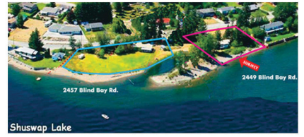
TWO 40,000 SQ.FT. WATERFRONT LOTS SHUSWAP LAKE, BC, CANADA OFFERED AT $1.5 MILLION EACH

175 acre semi waterfront property on Anstey Arm - Shuswap Lake, British Columbia, property is in the progress of being sub divided into 4 lots - three 50 acre parcels and one 25 acre parcel - waterfront lots in the front of property may also be for sale, www.ansteyarm.ca