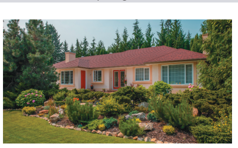
BLIND BAY - SHUSWAP, BC 2450 Blind Bay Rd. $899,000

Take advantage of this truly one of a kind prime development opportunity on Shuswap Lake with 500 feet of frontage on a 40,000 sf level lot and shared Lagoon. Act fast this will not last long!! www.2449blindbay.com