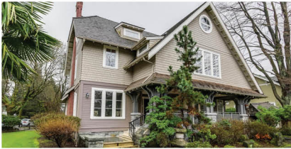
SHAUGHNESSY LUXURY 3812 OSLER $7,880,000

我们将竭诚为您提供最优质的服务。请致电我们的经纪人： Jimmy Ng 604-761-0011