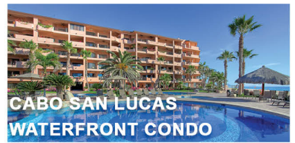
CABO SAN LUCAS WATERFRONT CONDO WATERFRONT CONDO 502 - VILLA 4 ELZALATE (KM 29) $499,000 USD

The "Qube" 2-bed, 2 bath in the heart of Coal Harbour. High quality finished S/W corner bright unit. Reno'd kitchen, new appliance, bathroom upgrades, new flooring. Parking Stall #172, no storage locker. Rentals & pets ok. Vacant.