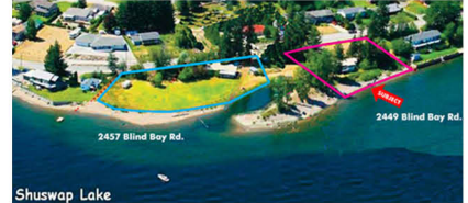
TWO 40,000 SQ.FT. WATERFRONT LOTS SHUSWAP LAKE, BC, CANADA OFFERED AT $1.5 MILLION EACH

175 acre semi waterfront property on Anstey Arm - Shuswap Lake, British Columbia, property is in the progress of being sub divided into 4 lots - three 50 acre parcels and one 25 acre parcel - waterfront lots in the front of property may also be for sale, www.ansteyarm.ca