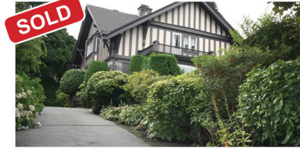
SHAUGHNESSY VANCOUVER WEST 1080 WOLFE AVE. $8,380,000

6000 sq/ft heritage style home with 8 bedrooms and 4 bathrooms on 4 levels. Gourmet chef's kitchen appointed with high end appliances and finishes. Large principal rooms for entertaining, media room with wine cellar. 10,000 sq/ft lot.