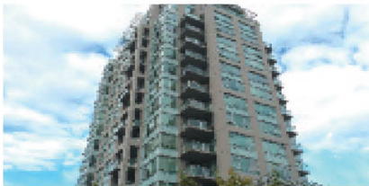
SYMPHONY - NORTH VANCOUVER PH PH1600-120 W 16TH ST., NV $1,998,000

Beathtaking views in all direction. 1935 s/f penthouse 1 level 2 bed + den with 2-1/2 bath and 1040 s/f patio. feature incl: Brazilian H/W floor, 10' ceilings, 2 F/P, high end appliance and more.