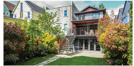
VANCOUVER EAST 790 E GEORGIA $1,800,000

Stunning 6000 sq.ft 5 bed, 5 bath Tudor Mansion sits on over 27,000 sqft of beautifully landscaped gardens. Large principal rooms on the main floor with all heritage features intact. The quality and craftsmanship in this beautiful home cannot be matched today.