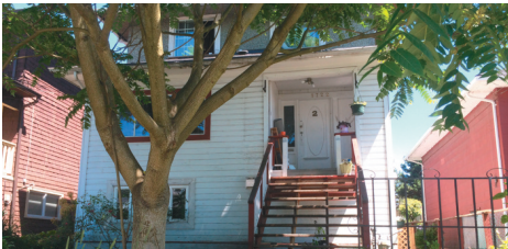
COMMERCIAL DRIVE, VAN EAST 1722 Cotton Drive $1,288,000

2 level, 4 bed, 3 bath, 4,294 s/f home on a 9,800 s/f lot (82x118). H/W flooring with in-floor heating, double-pane windows, 9.5' ceilings, 2 gas f/p, wrap-around deck, solarium, 3 car garage w/workshop. Buyer to verify measurements.