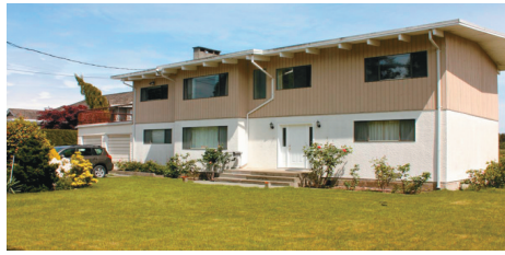
RICHMOND BLUEBERRY FARM 9660 No. 6 Road $3,488,000

A California inspired 2100 s/f executive home with a quick walk to Downtown. Features incl. extensive use of decorative stone with luxurious wood cabinets. The appliance package: Sub-Zero, Bosh & Viking Kitchen brands. ($500K spent)