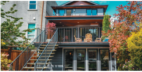
MOUNT PLEASANT - VAN EAST 790 E Georgia St. $1,799,000

我们将竭诚为您提供最优质的服务。请致电我们的经纪人： Jimmy Ng 604-761-0011