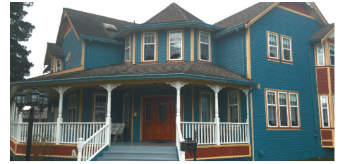
McNAIR - RICHMOND 10391 Dennis Crescent $1,479,000

9.7 acres. Best priced Blueberry farm in Richmond. Duke and Bluecrop varieties. Includes approximately 3,000 sf 6 bedroom, 3 bathroom home with 2 car garage. Low taxes ($457/yr), close to Silver City Riverport Cinemas.