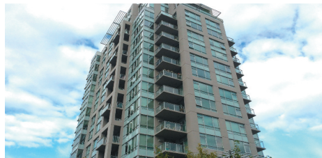
SYMPHONY - NORTH VANCOUVER PH PH1600-120 W 16th St., NV $1,998,000

Renovated and updated investment property with 3 suites $1250/mo main, $1250/mo basement & $850/mo up - total over $40K/yr - potential development suite.