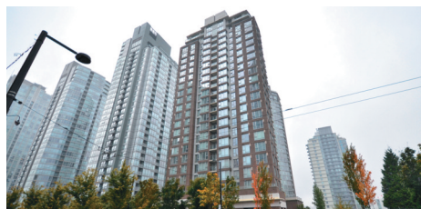
YALETOWN - DT VANCOUVER #507-550 Pacific St. $399,000